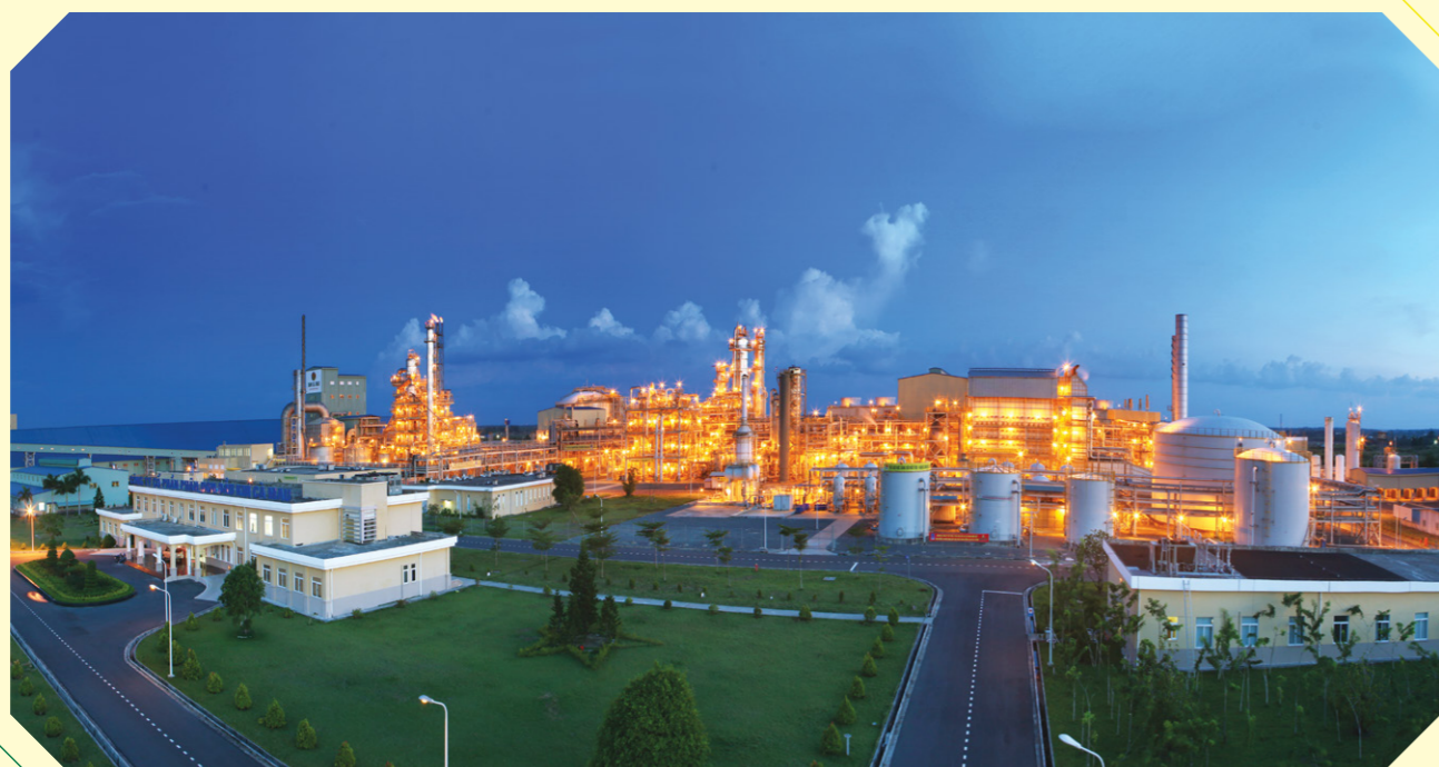
Overview of Ca Mau Fertilizer Plant in Ca Mau Gas – Power – Fertilizer Complex

Given both challenges and opportunities, in 2021 PVCFC continued to record proud achievements in both production and business. Total revenue reached VND 10,041.67 billion, 10% higher than the plan. Profit before tax and profit after tax attained VND 1,956.27 billion and VND 1,826.12 billion, exceeding the plan by 12% and 11%, respectively. In production, converted-to-Urea output reached 898.56 thousand tons, an increase of 3% compared to the plan and trading of imported fertilizers reached 161.07 thousand tons, exceeding 7% of the plan.